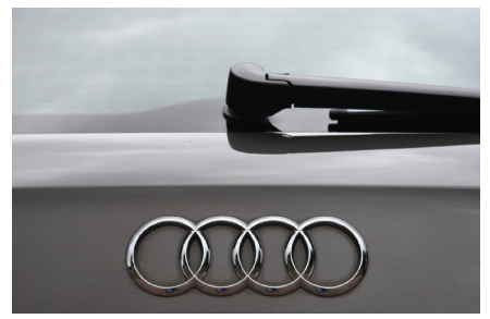
Rear badge detail