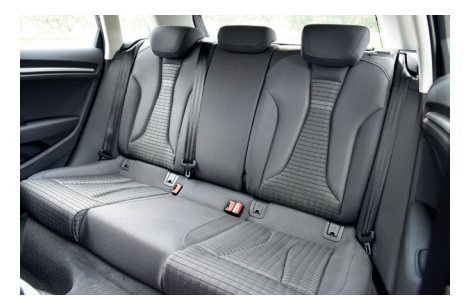
Rear interior 3 door