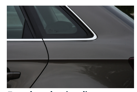
Exterior trim detail