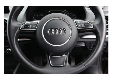
Steering wheel detail