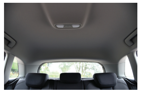
Rear interior light