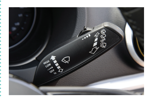
Windscreen wiper control