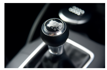
Gear stick / selector