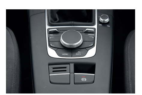
Centre console dial