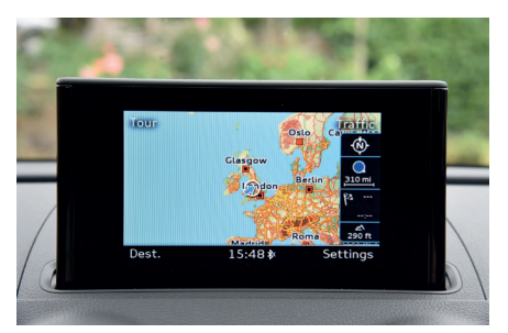
Screen - nav mode