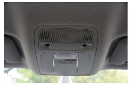
Front interior light