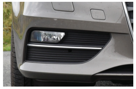
Spoiler / foglight detail