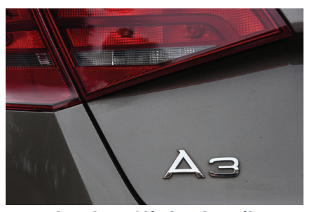
Rear badge / light detail