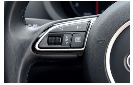
Steering control (left side)