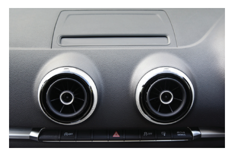
Sat nav - in off position