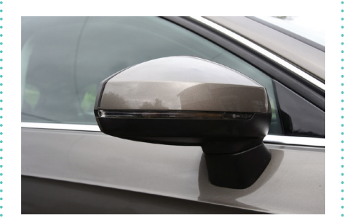
Wing mirror detail