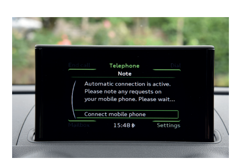
Screen - telephone mode