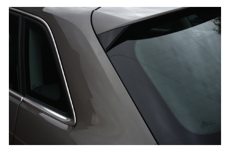
Exterior trim detail