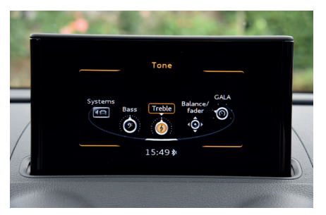
Screen - sound mode