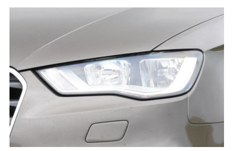
Front light detail