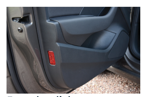
Front door light