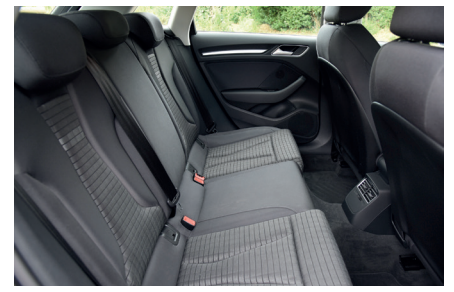
Rear interior (driver's side)