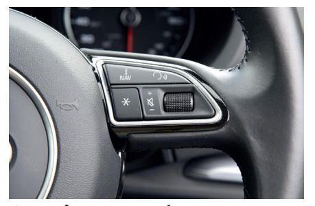
Steering control (right side)