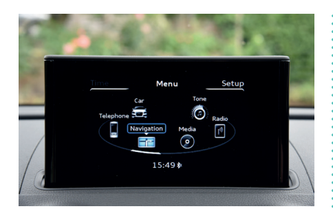
Screen - menu mode