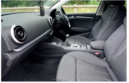
Front interior side on (passenger's side)