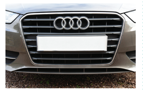
Front grill detail