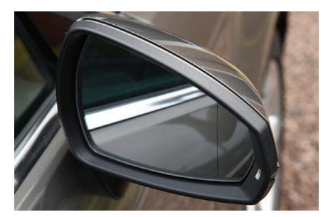
Wing mirror detail