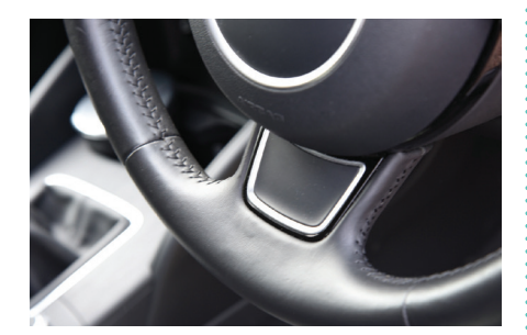
Steering wheel detail