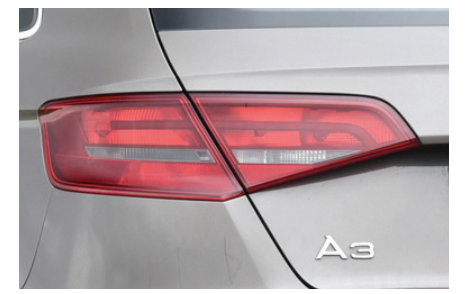
Rear light detail