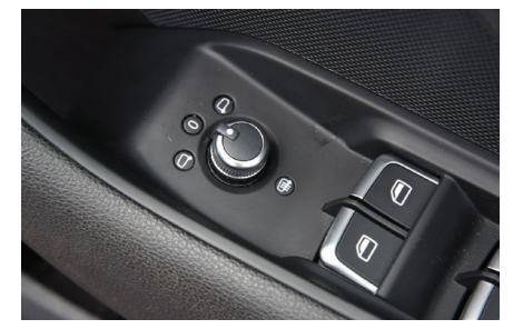
Wing mirror / window control